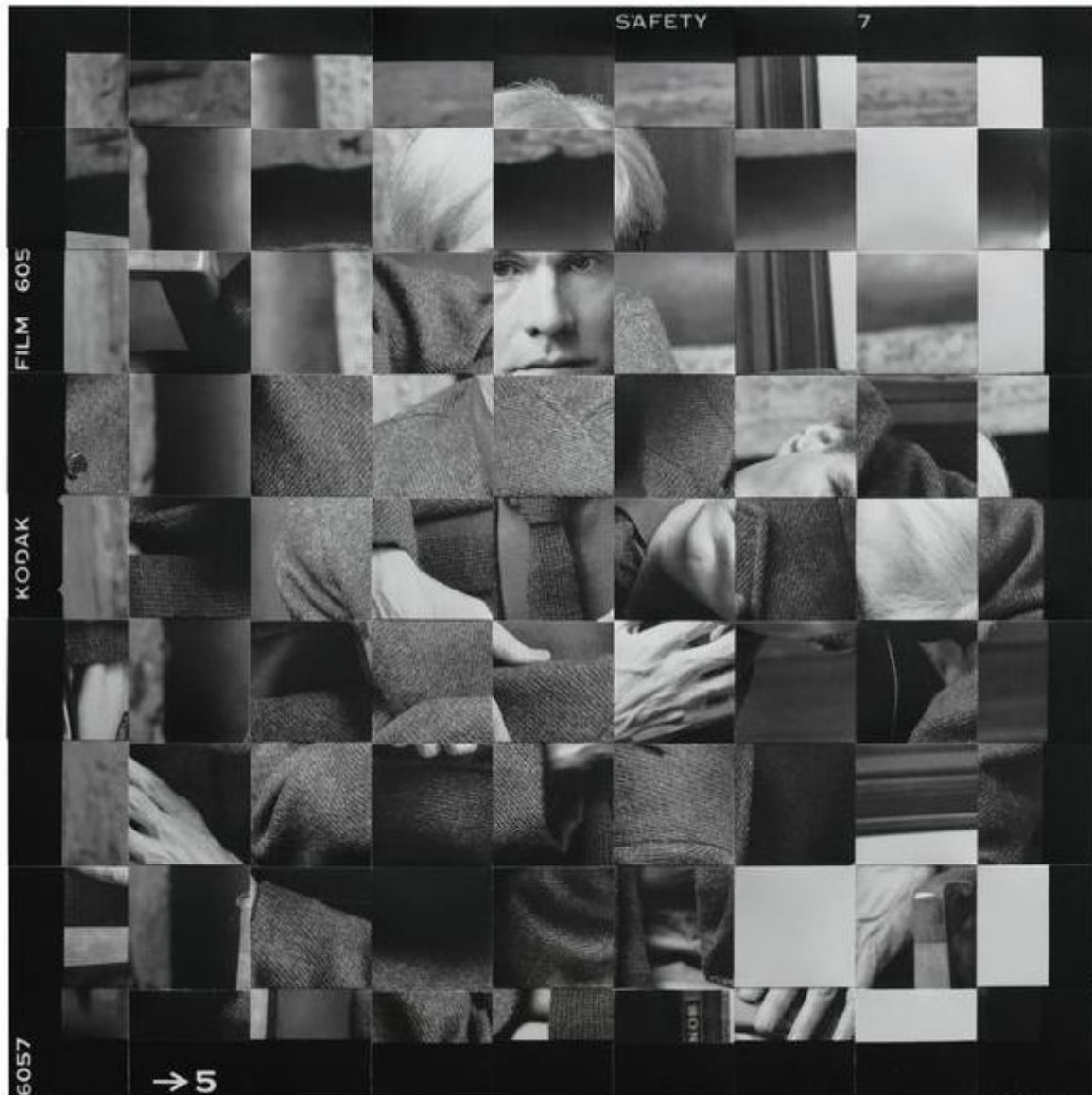
Serena Maisto – De-composition Andy 2, large strip 50x50 cm